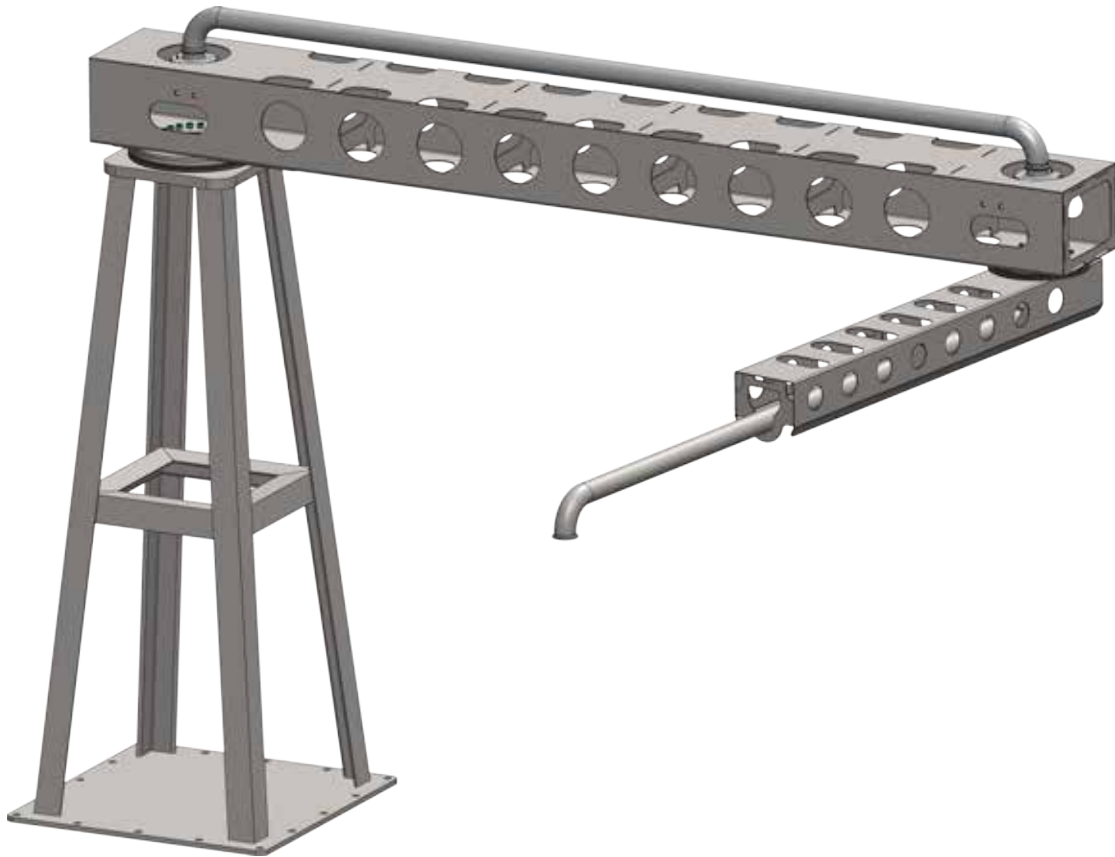
Plate Freezer Filling Arm