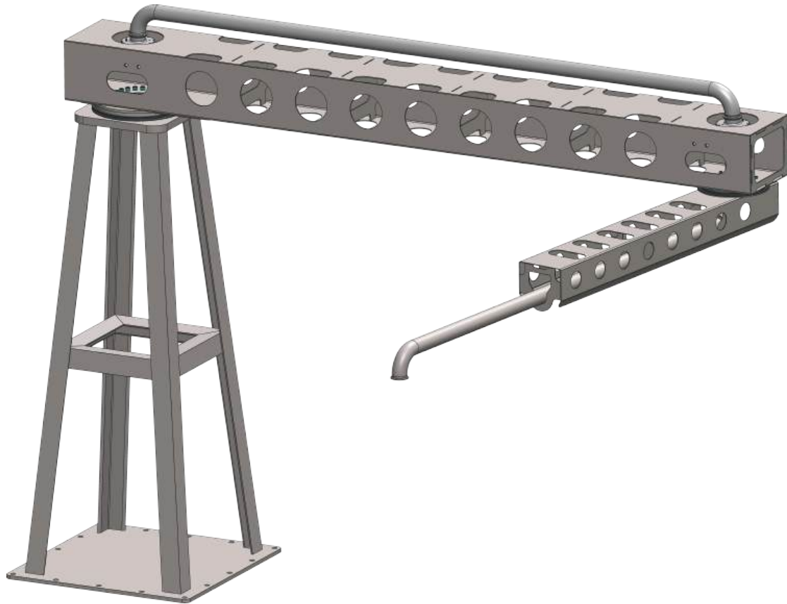
Plate Freezer Filling Arm